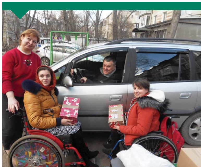
Blythwood shoeboxes were delivered to the homes of people with disability for whom it is not so easy to travel around the town