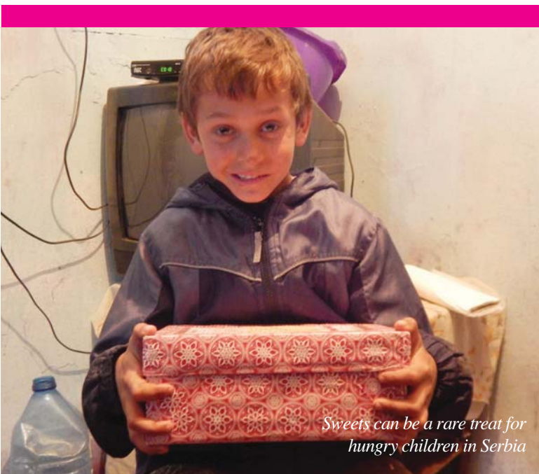
Sweets can be a rare treat for hungry children in Serbia