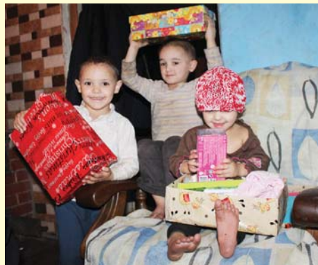
Uzhhorod, Ukraine: 'the kids immediately put on everything that they found in the boxes' (see page 7)

In a brick factory in Pakistan, a child labourer dreamed she was playing with a doll.