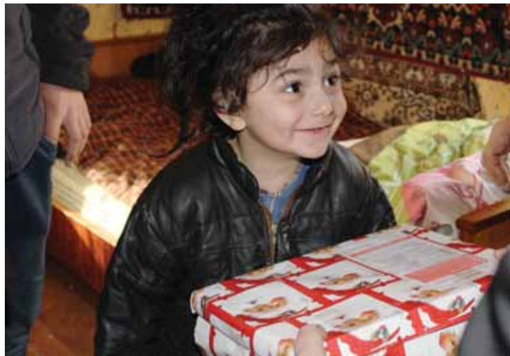
A child in Ukraine receives a shoebox – see page 4

All your gifts – even the most basic – do make a difference. Just think: what would it mean