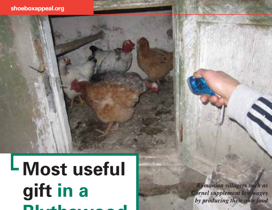
Romanian villagers such as Cornel supplement low wages by producing their own food