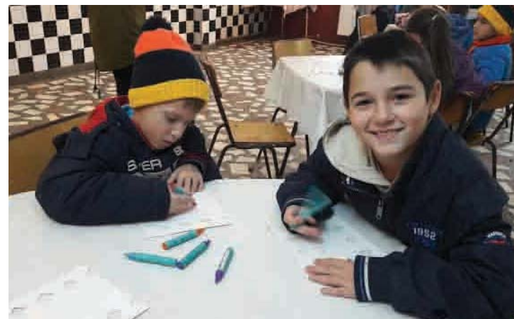
Children at Ilisua: a healthy diet is especially important for those who may have been exposed to tuberculosis

"They have three meals and a snack every day, which is more than their parents could ever provide at home."