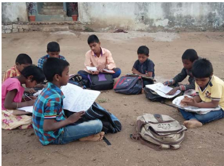
Regular meals give the children at Dayspring the energy they need to study and play

"Thanks to your support, these children are doing well."