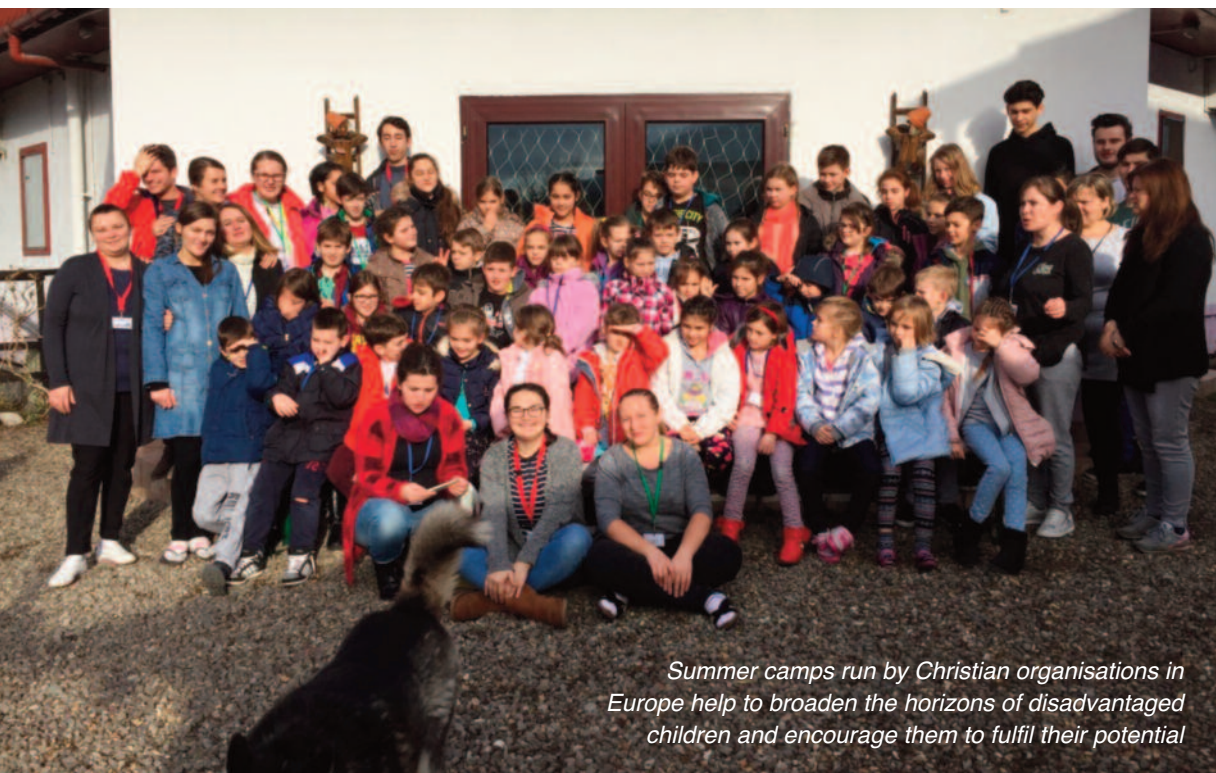
Summer camps run by Christian organisations in Europe help to broaden the horizons of disadvantaged children and encourage them to fulfil their potential