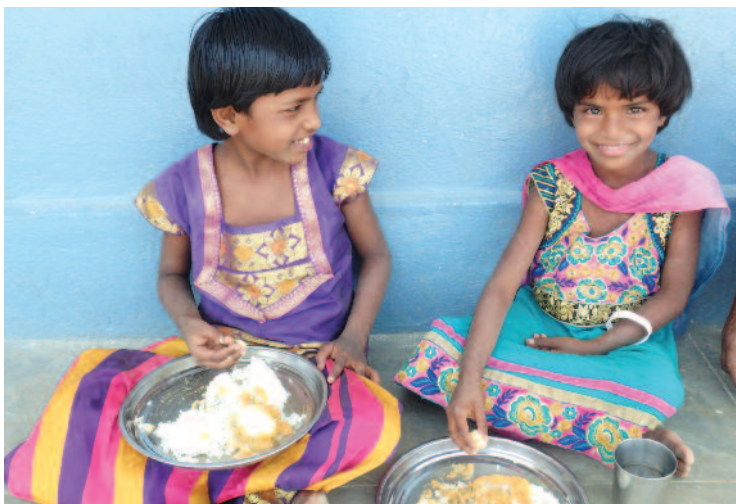
Children at Dayspring House near Hyderabad (see page 11).

Your gifts continue to fund nourishing meals for vulnerable children at three locations in India