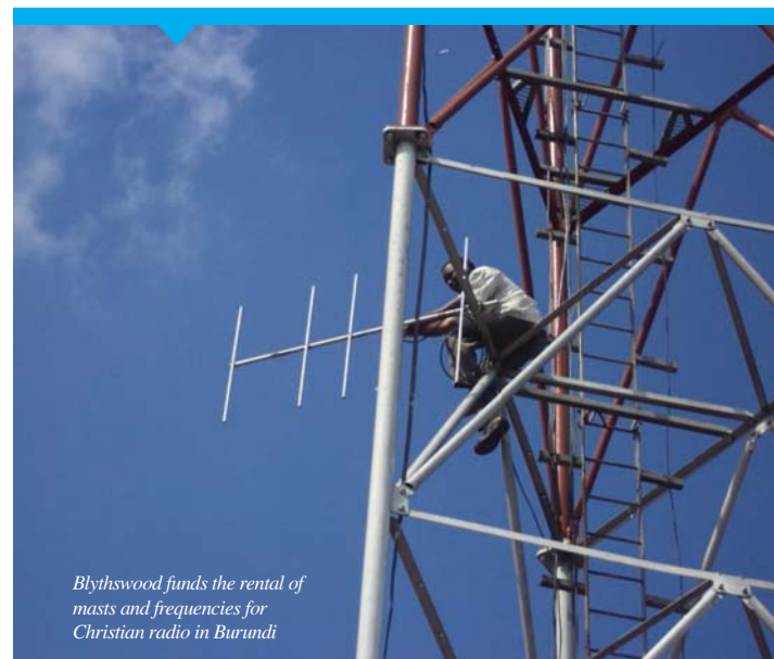
Blythswood funds the rental of masts and frequencies for Christian radio in Burundi