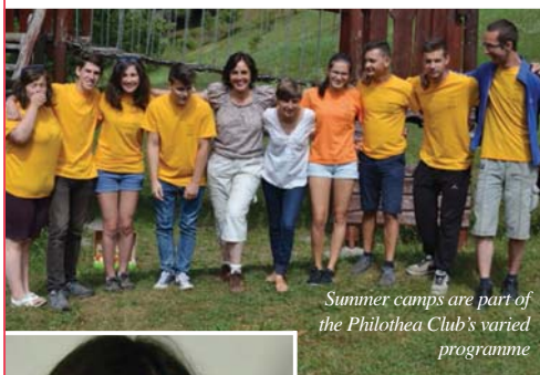
Summer camps are part of the Philothea Club's varied programme

Help support a pastor in Eastern Europe – Gift code CL3