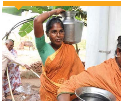
In India, women still carry water long distances

“Previously they struggled a lot for drinking water but now they are happy. The new well is a great help to them, especially to the women.”